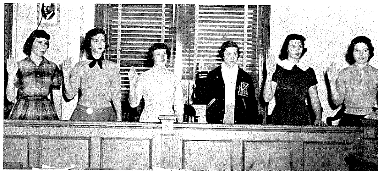
Jurors Sworn In