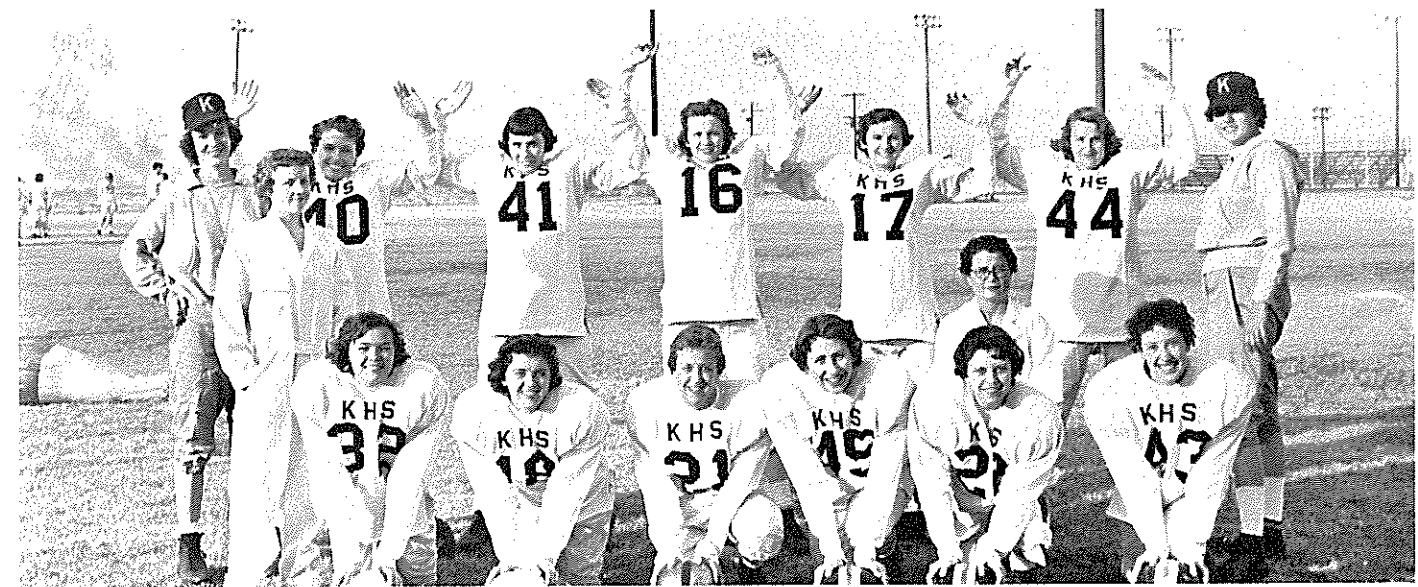
SENIOR GIRLS' FOOTBALL TEAM